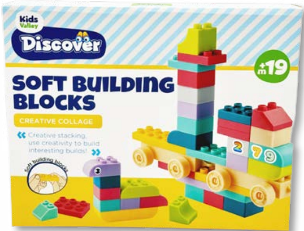
ANIMALS SOFT BUILDING BLOCK 78 PCS