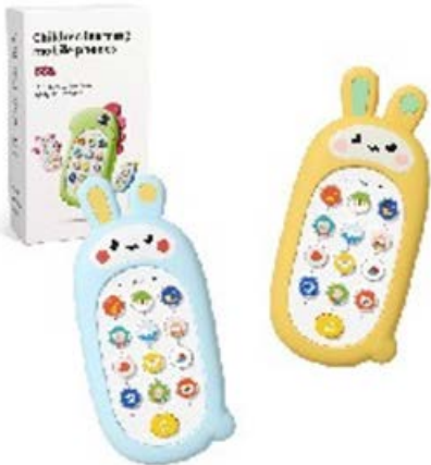
RABBIT SILICONE CASE PHONE