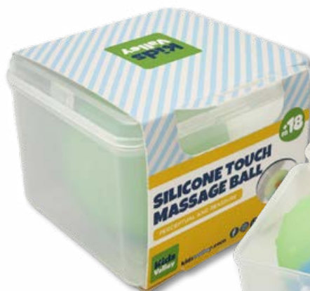
SILICONE TOUCH MASSAGE BALL