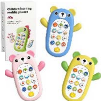
BEAR SILICONE CASE PHONE