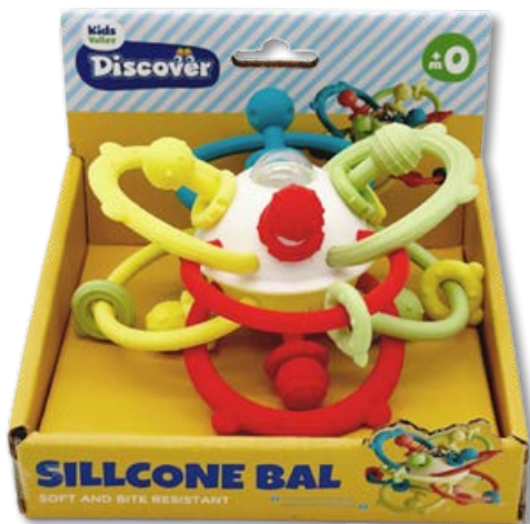
SILICONE HAND GRAB BALL