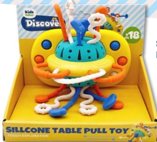
SILICONE TABLE PULL TOY