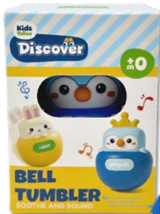
PENGUIN SILICONE TUMBLER