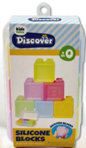
SILICONE BUILDING BLOCKS