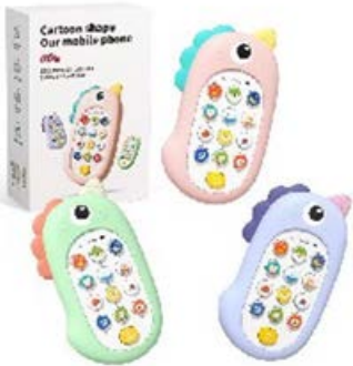
UNICOEN SILICONE CASE PHONE