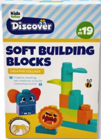
ANIMALS SOFT BUILDING BLOCK 15 PCS