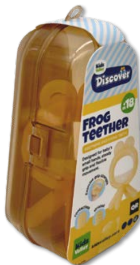
SILICONE FROP TEETHER