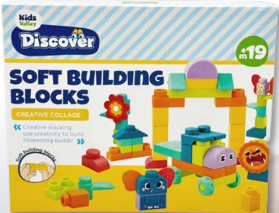
ANIMALS SOFT BUILDING BLOCK 64 PCS