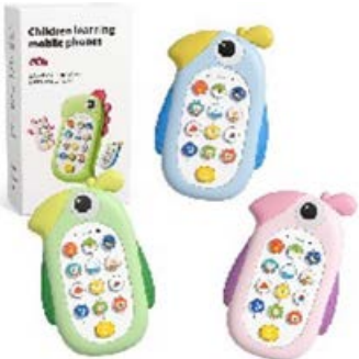
PARROT SILICONE CASE PHONE