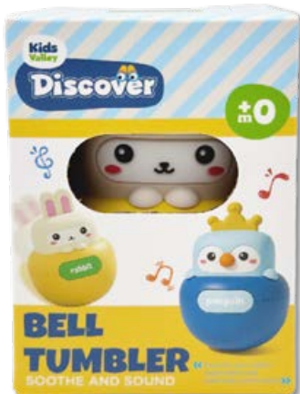
RABBIT SILICONE TUMBLER