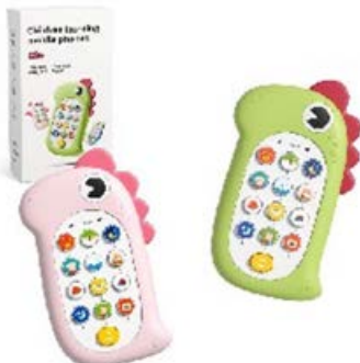
DINOSAUR SILICONE CASE PHONE